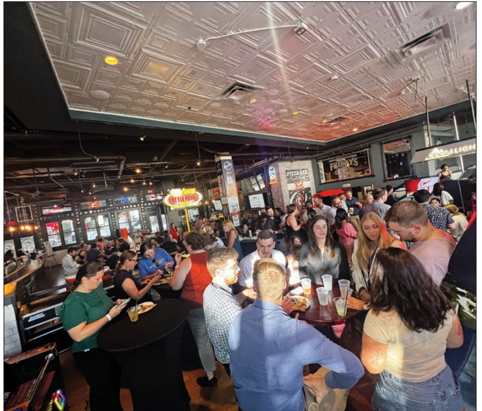
IAFP hosted a special Iowa event at National Conference where Iowa students, residents, program directors, program coordinators and faculty gathered to both socialize and answer students' questions.