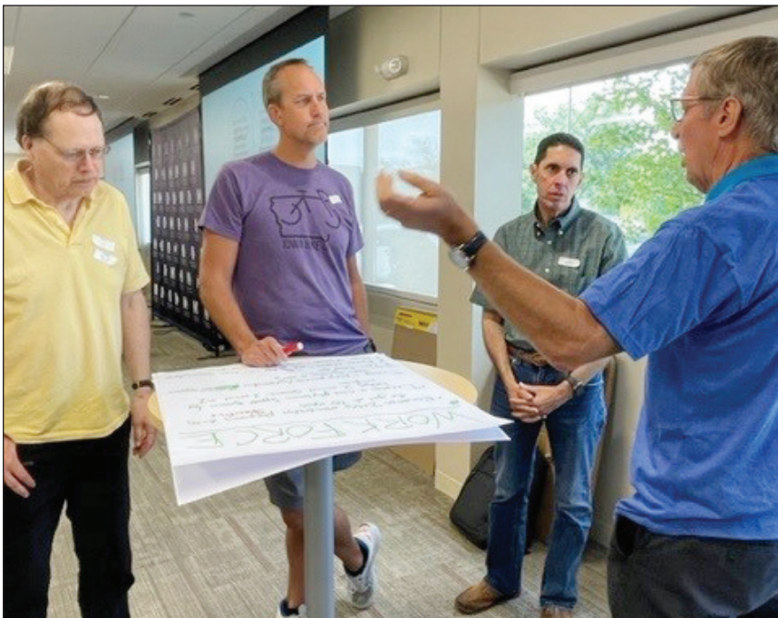
IAFP board members and staff spent a day developing IAFP's new strategic plan. We are excited to start implementing the new ideas. We plan to share more about the strategic plan in future magazines.